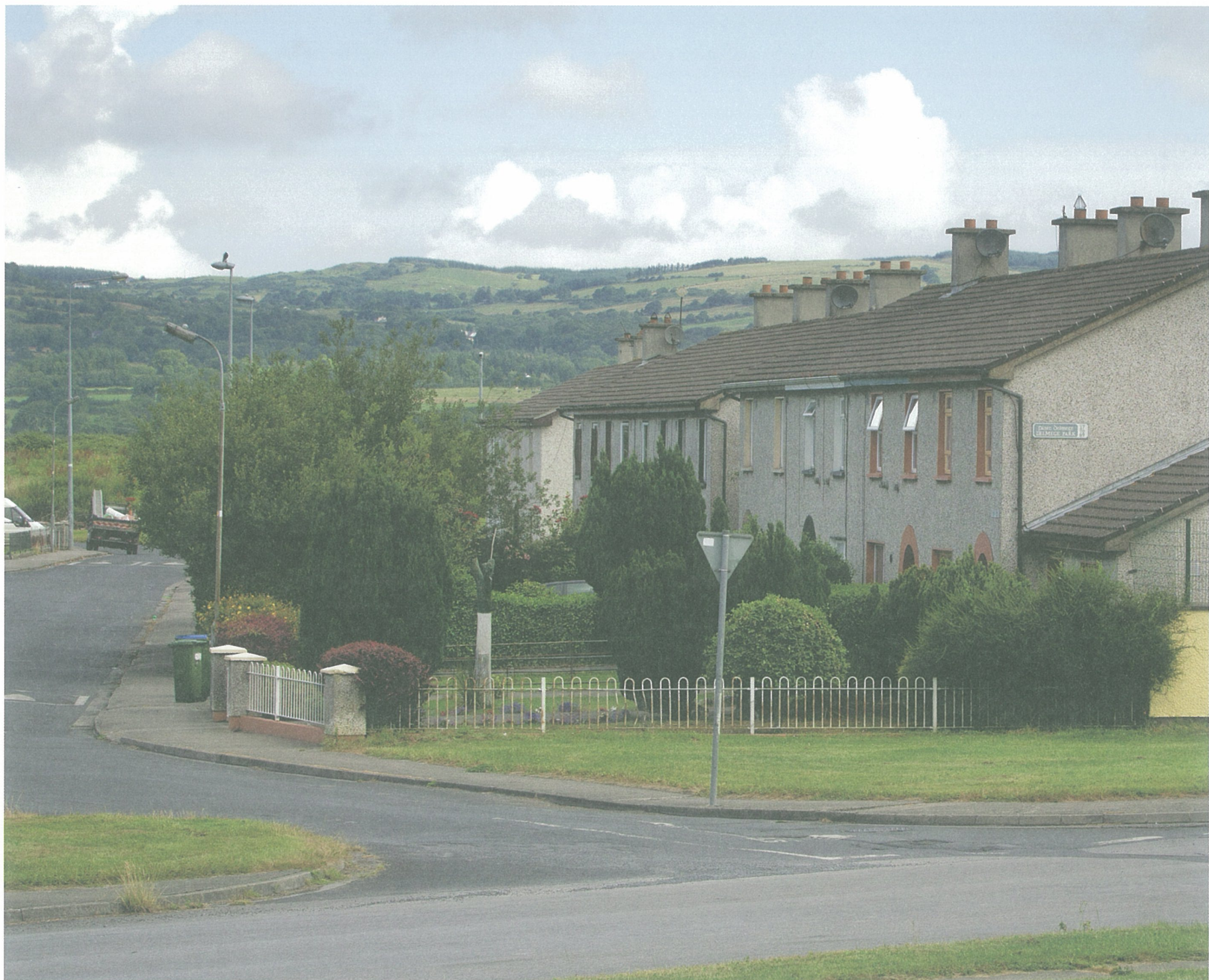
▼ Delmege Park, Moyross