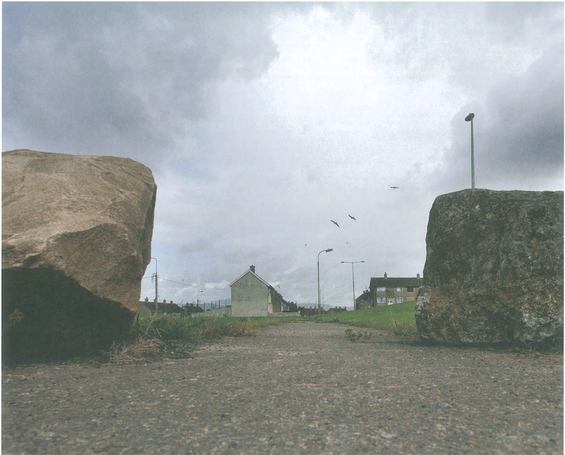
▼ O' Malley Park, Southill