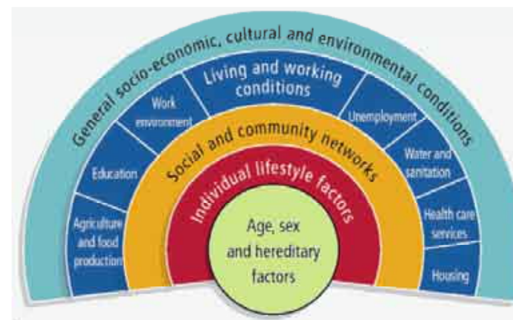
Fig 1 Broad Determinants of Health - Dahlgren (1995)