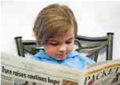
‘Enhanced senior management capacity for education in Limerick’