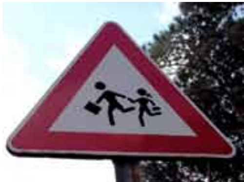
‘Institutional and cultural changes needed in education’