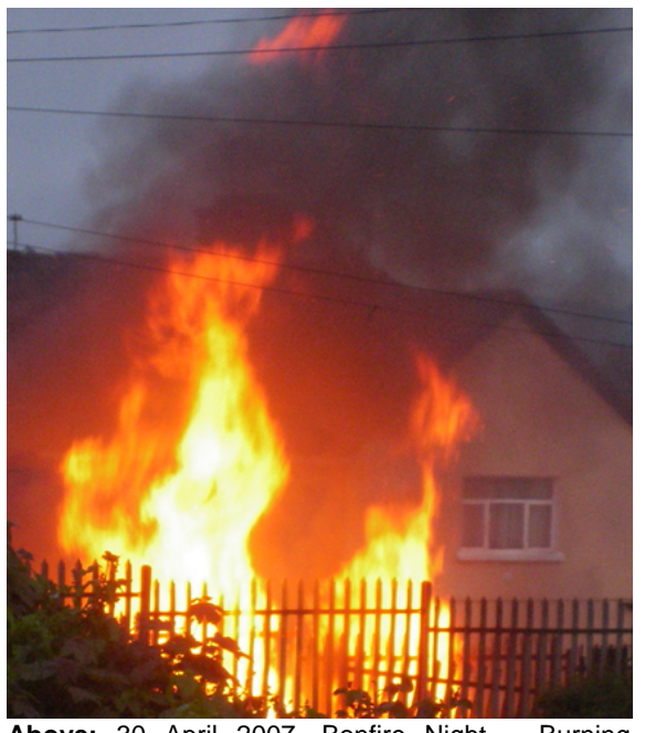
Above: 30 April 2007, Bonfire Night – Burning rubbish in Clarina Ave. For a while it seemed that Bonfire Night was a weekly event. As well as the health risk, such fires have damaged phone lines.