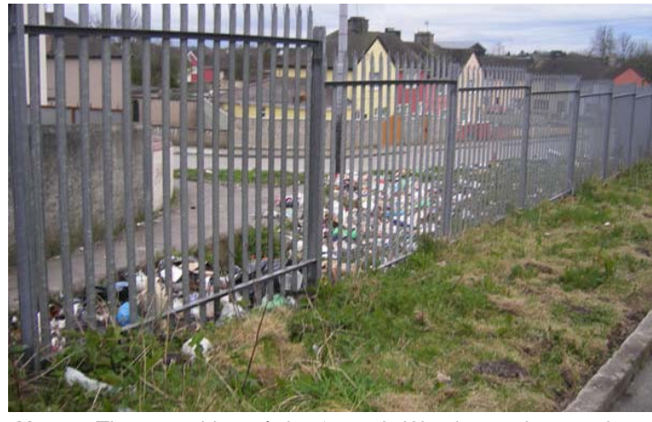
Above: The two sides of the 'green'. We do our best to keep Weston Gardens tidy. The illegal dumping is being done by a handful of residents in Ballinacurra Weston. The resultant rat infestation and health risks posed to residents are major concerns.