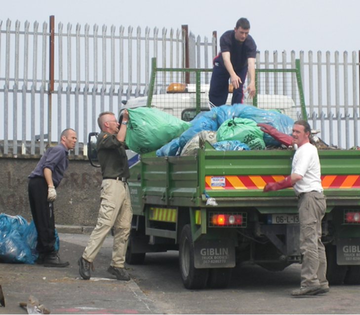
Above: 30 April 2007 Residents clean up. The WGRA registered with An Taisce's National Spring Clean to clean up the gardens of No.'s 1, 2 & 3. We needed permission from LCC's Housing Dept., which wasn't given. We went ahead regardless, removing 8½ tons.