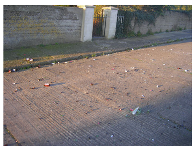
Above: Our Avenue littered with broken bottles thrown by youths from Clarina Avenue. This used be a regular occurrence, especially at weekends. Such incidents are less frequent now, the last one being March 2007.