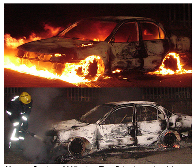
Above: October 2007, the Fire Brigade extinguishes a burning stolen car. This incident left Weston Gardens inaccessible for several hours. This problem is ongoing. Often, driveways have been blocked and property damaged.